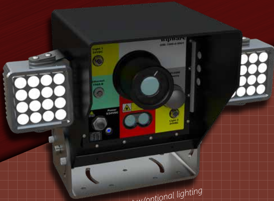
Reflex instrument w/optional lighting